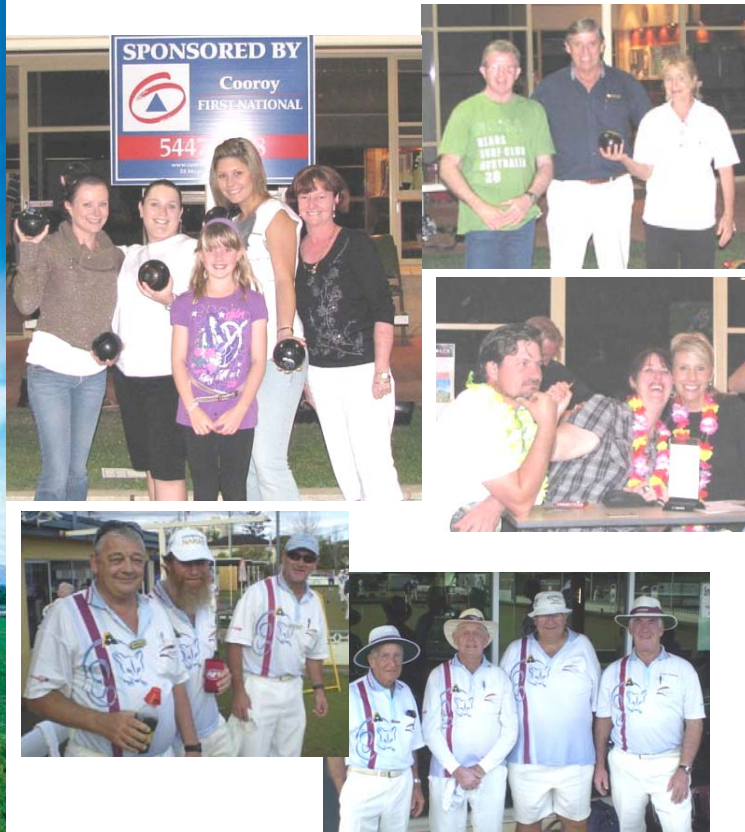
Top—Australia's Biggest Lawn Bowls Tournament - Team Cooroy News agency, First National and the Wildcard team!

Our Pennants boys Division 7—Go the Possums!