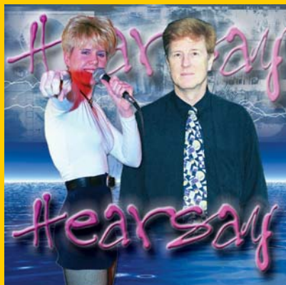
Hearsay April 18