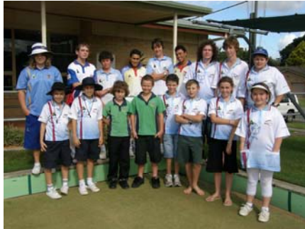
Junior District Day!