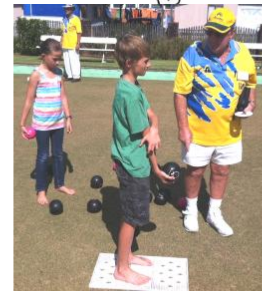
Sunshine Coast Academy training day