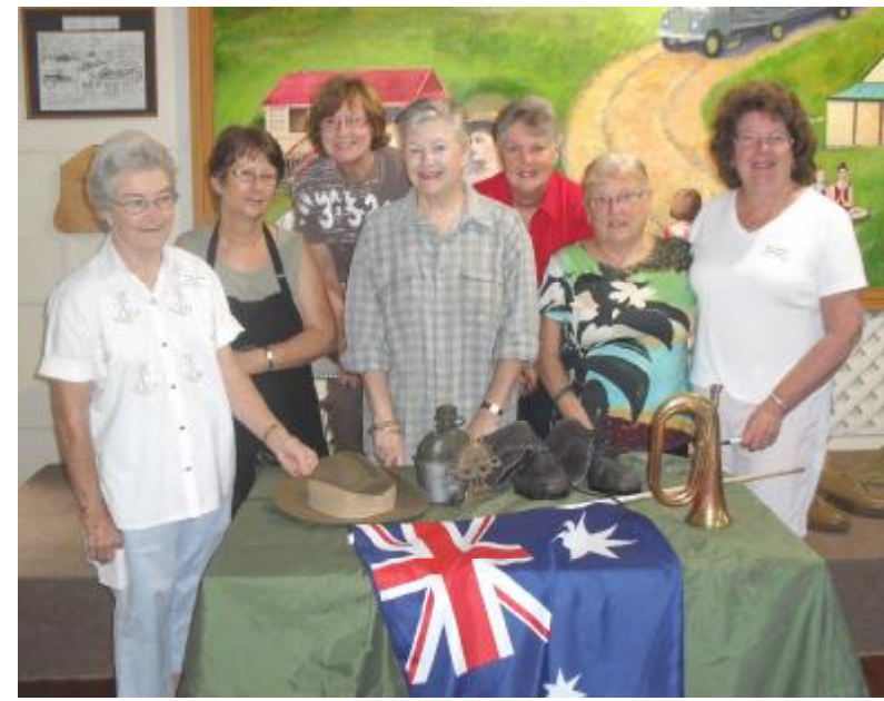
Girls from the Tishbrook Art Group for the Spirit of Anzac Exhibition