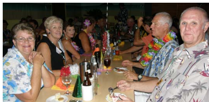
NEW YEARS EVE REVELLERS